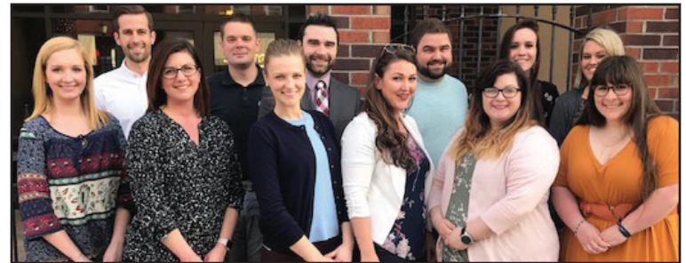
Front Row left to right :

Young Leaders will be better prepared to take on the responsibilities. The Chamber of Commerce will present a Young Leader of the Year award each year at the Chamber's annual dinner. An application to join and more information is available on the Chamber's website – www.cambridgeohiochamber.com There is also a Facebook page, Young Leaders of Guernsey County, where one can find more information.